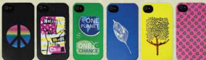
BIO-IP4-01G1 BIO-IP4-01G2 BIO-IP4-28G4 BIO-IP4-03G3 BIO-IP4-16G6 BIO-IP4-12G5

Retail Packaging Dimensions: 5.62"H x 2.5"L X 0.58"D