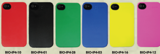
BIO-IP4-10 BIO-IP4-01 BIO-IP4-28 BIO-IP4-03 BIO-IP4-16 BIO-IP4-12